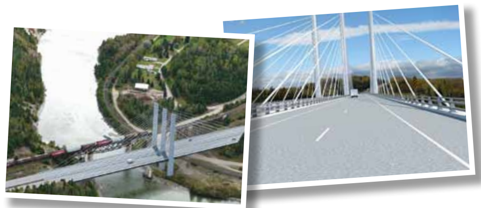
Renderings of the new Nipigon River cable-stayed bridge, part of the four-laning work on the Thunder Bay to Nipigon corridor.

And the Nipigon River Bridge is being completely reconstructed as a cable-stayed bridge, with four-laning on approximately 3 km approaching the new bridge from both directions. It's a project that will not only improve safety, but create a significant and beautiful new landmark for both travelers and the community.