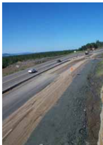
Four-laning work on Hwy 11/17 is right on schedule. Here is a viewpoint near the Terry Fox Lookout.