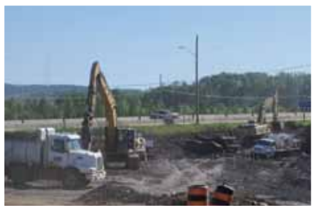
The new interchange and ramps at Hodder Avenue have been fascinating to watch as they take shape.

In total, that brings the number of expansion projects funded by NHP on our Thunder Bay to Nipigon corridor to seven. Already, over 20 kms are under construction.