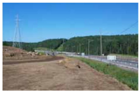
Construction on the ramps at Copenhagen Road.